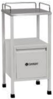
GK 2002 BED SIDE LOCKER GENERAL