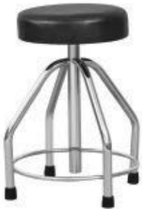
GK 4000 REVOLVING STOOL CUSHIONED TOP