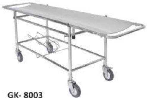
GK- 8003 S.S. STRETCHER TROLLEY BASIC