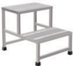
GK 4005 DOUBLE FOOT STEP SS