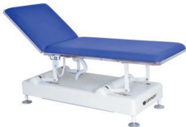
GK- 7000 MOTORISED EXAMINATION COUCH