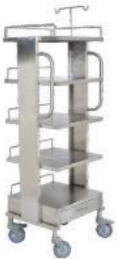
GK 3011 MONITOR TROLLEY SS