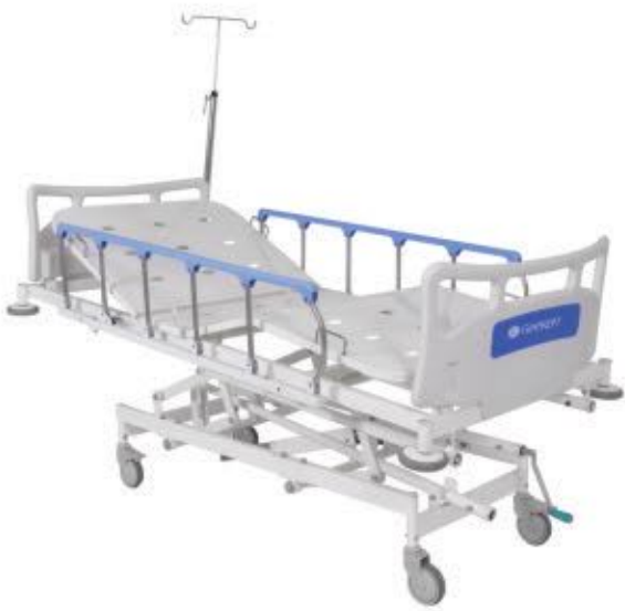
GK- 1000 MANUAL ICU BED