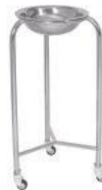
GK 4012 BASIN STAND SINGLE