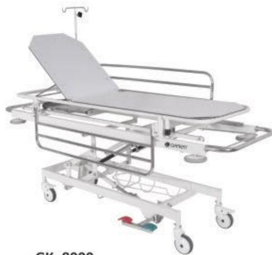
GK- 8000 EMERGENCY & RECOVERY TROLLEY