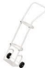
GK 4011 OXYGEN CYLINDER TROLLEY MS