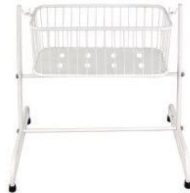
GK- 1010 BABY CRIB