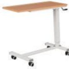
GK 2005 OVER BED TABLE MS WITH MEMBRANE TOP