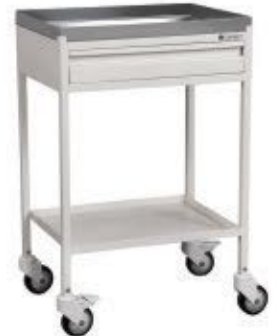
GK 3003 ECG TROLLEY