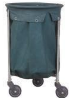
GK 6009 SOILED LINEN TROLLEY SS