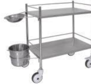
GK 3007 DRESSING TROLLEY