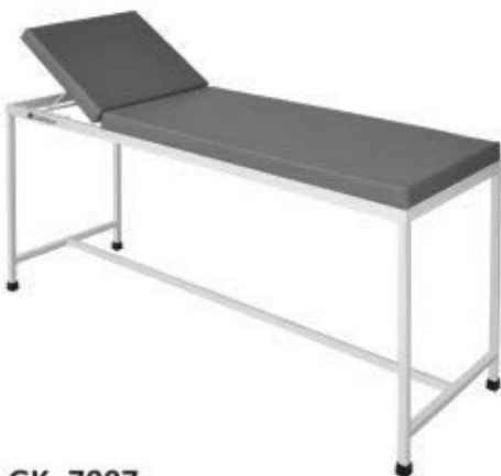
GK- 7007 HOSPITAL EXAMINATION TABLE