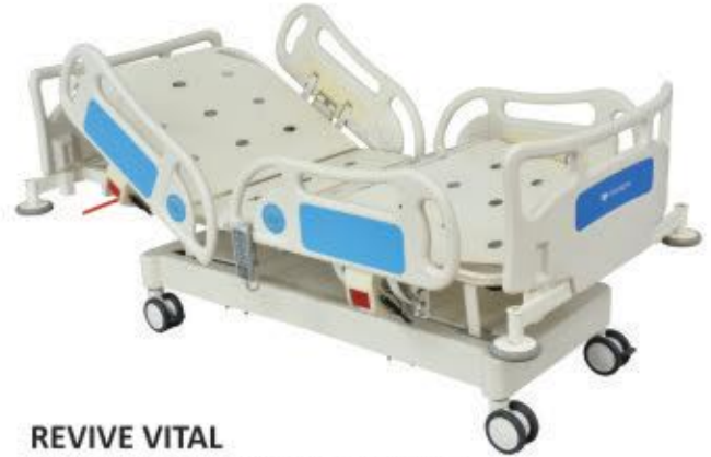
REVIVE VITAL MOTORISED ICU BED WITH 4 FUNCTION