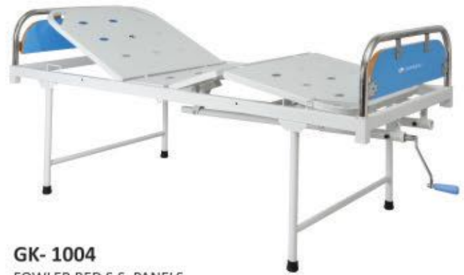
GK- 1004 FOWLER BED S.S. PANELS