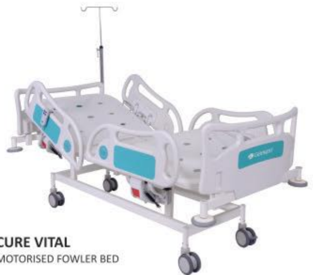
CURE VITAL MOTORISED FOWLER BED