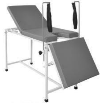
GK- 7006 GYNAE EXAMINATION TABLE BASIC