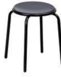
GK4012 BED SIDE STOOL