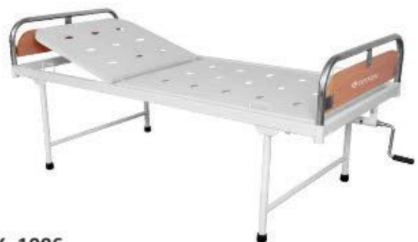
GK- 1006 SEMI-FOWLER BED S.S. PANELS