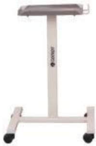
GK 3004 SUCTION MACHINE TROLLEY