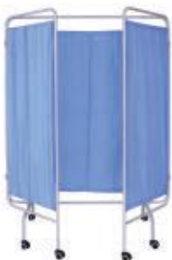
GK 4014 THREE FOLD SCREEN MS