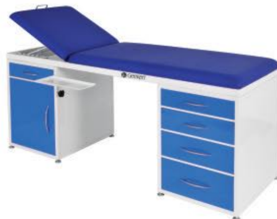
GK- 7002 EXAMINATION COUCH DELUXE