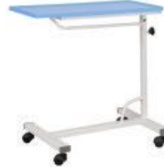
GK 2006 OVER BED TABLE MS BASIC WITH MEMBRANE TOP