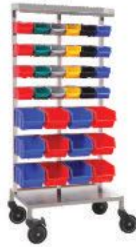
GK 3001 OT DRUG TROLLEY