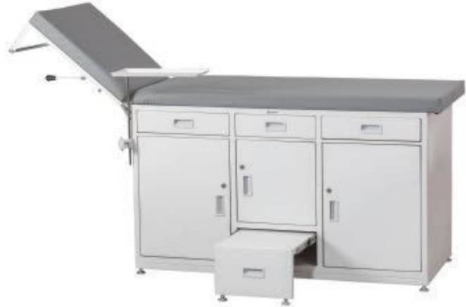
GK- 7003 A EXAMINATION COUCH WITH FOOT REST