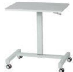
GK 2007 OVER BED TABLE MS BASIC WITH MEMBRANE TOP