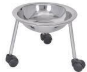
GK 4013 KICK BUCKET