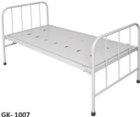
GK- 1007 BASIC STEEL BED