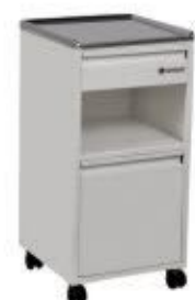
GK 2001 BED SIDE LOCKER SS TOP