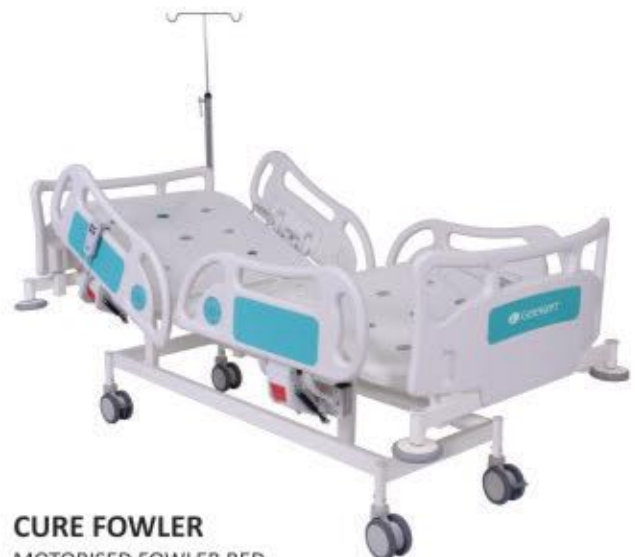
CURE FOWLER MOTORISED FOWLER BED