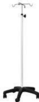
GK 4010 SALINE STAND NYLON BASE AND SS ROD