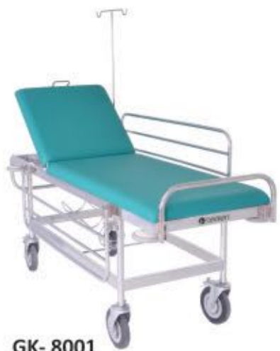
GK- 8001 S.S. STRETCHER DELUXE