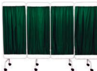
GK 4015 FOUR FOLD SCREEN MS