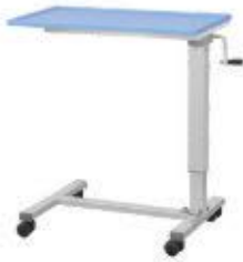
GK 2004 OVER BED TABLE SS WITH MEMBRANE TOP