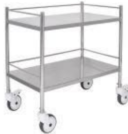
GK 3005 INSTRUMENT TROLLEY