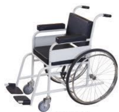
GK- 8006 WHEEL CHAIR FIXED