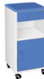
GK 2000 BED SIDE LOCKER MEMBRANE TOP