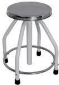
GK 4002 REVOLVING STOOL SS TOP