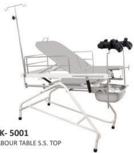
GK- 5001 LABOUR TABLE S.S. TOP