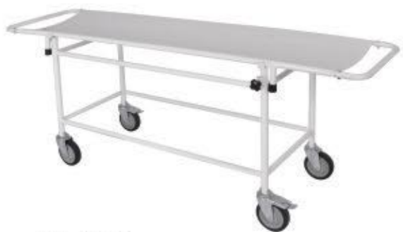
GK- 8005 M.S. STRETCHER TROLLEY BASIC