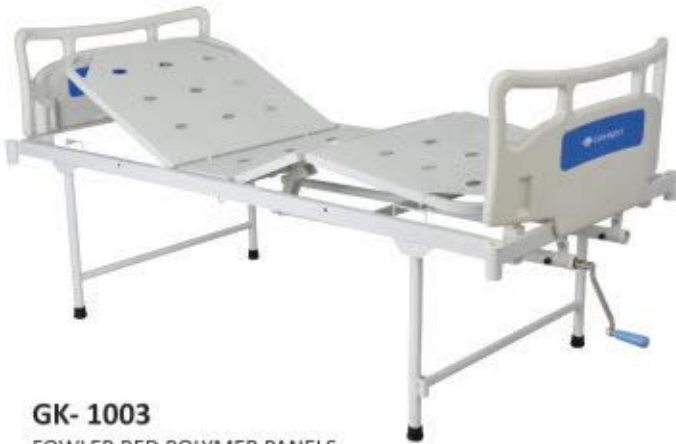
GK- 1003 FOWLER BED POLYMER PANELS