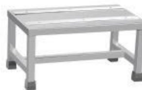
GK 4007 SINGLE FOOT STEP SS