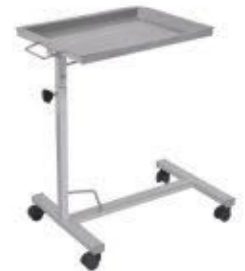
GK 3009 MAYO TROLLEY SS