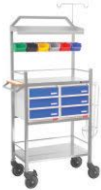
GK 3000 CRASH CART SS