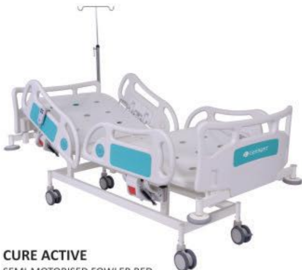
CURE ACTIVE SEMI-MOTORISED FOWLER BED (ONLY BACK REST MOVEMENT, ELECTRICALLY OPERATED)