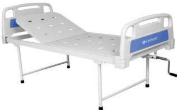
GK- 1005 SEMI-FOWLER BED POLYMER PANELS