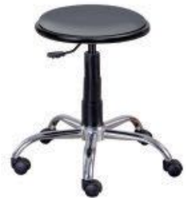
GK4013 REVOLVING STOOL