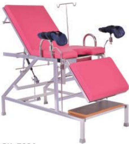
GK- 7004 GYNAE EXAMINATION TABLE DLX. S.S.