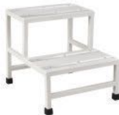
GK 4006 DOUBLE FOOT STEP MS