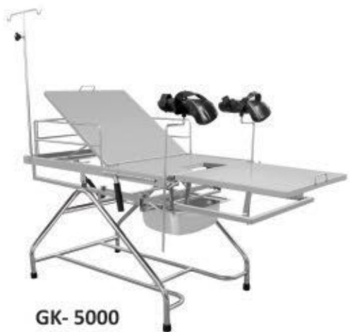
GK- 5000 LABOUR TABLE S.S.