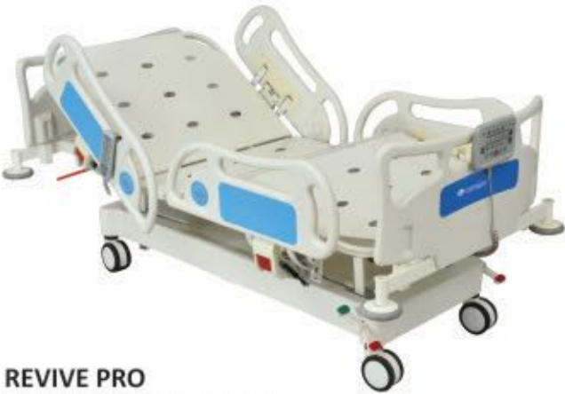
REVIVE PRO MOTORISED ICU BED WITH CPR