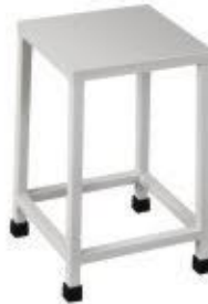
GK 4004 BED SIDE STOOL