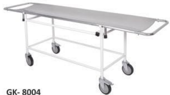
GK- 8004 S.S. TOP STRETCHER TROLLEY BASIC