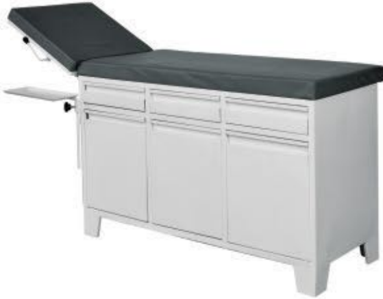
GK- 7003 EXAMINATION COUCH