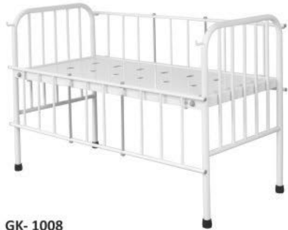
GK- 1008 PEDIATRIC GENERAL BED