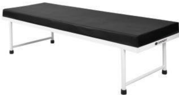
GK- 1009 PLAIN BED WITH MATTRESS