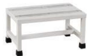
GK 4008 SINGLE FOOT STEP MS