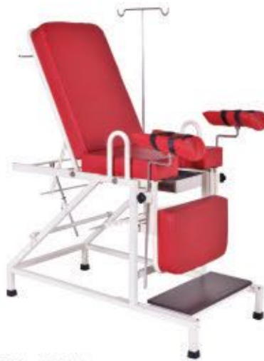
GK- 7005 GYNAE EXAMINATION TABLE DLX. M.S.