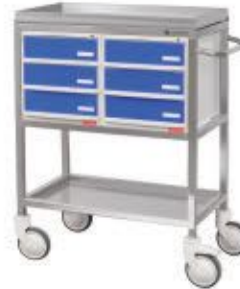
GK 3002 MEDICINE TROLLEY SS