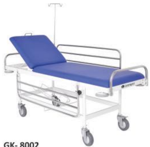
GK- 8002 M.S. STRETCHER DELUXE