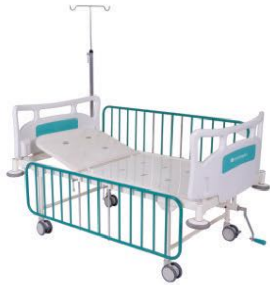
GK- 1011 PEDIATRIC SEMI FOWLER BED WITH WHEELS