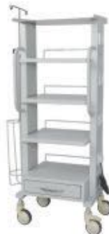
GK 3012 MONITOR TROLLEY MS